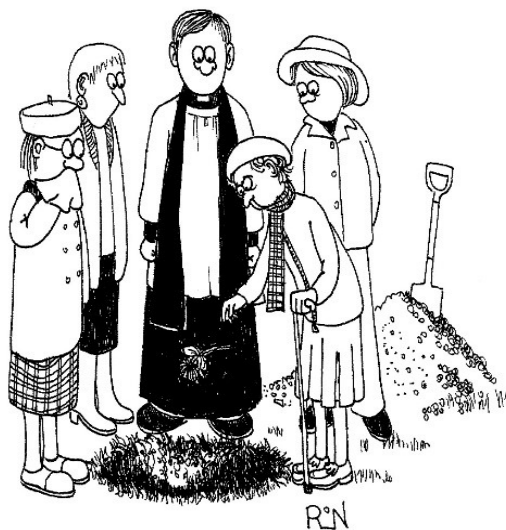
That old tea urn had served the church well